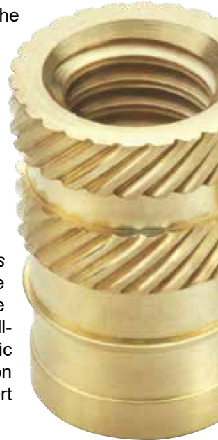
Figure 1. Undercuts, knurls and/or threads on the outside of the Insert improve performance

Though they are both dependent on localized melting of the plastic, heat and ultrasonic installation methods can result in varying performance. Both installation methods have advantages and disadvantages, which should be considered before investing in installation equipment.