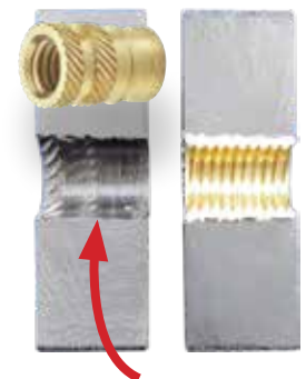
Figure 3. Improper Plastic Flow