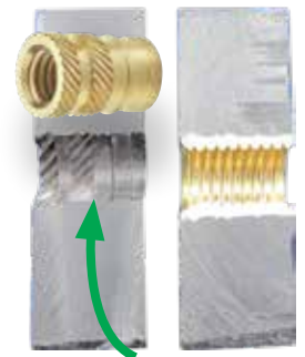
Figure 2. Proper Plastic Flow