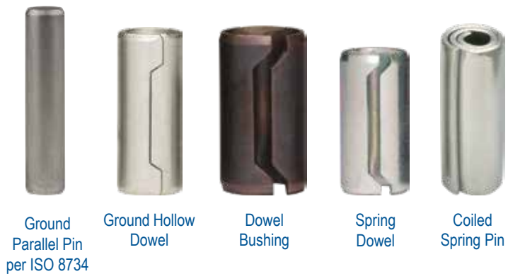
Ground Parallel Pin per ISO 8734 Ground Hollow Dowel Dowel Bushing Spring Dowel Coiled Spring Pin