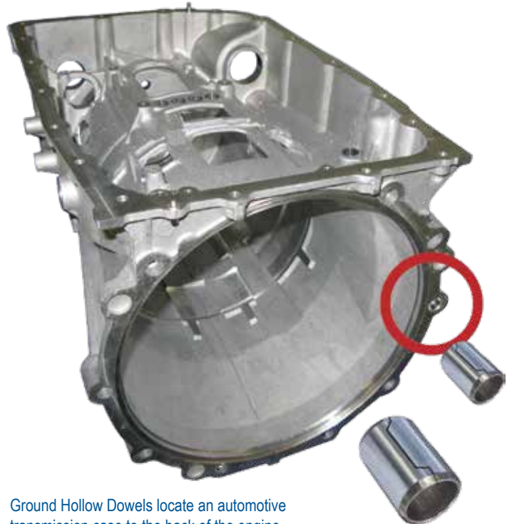
Ground Hollow Dowels locate an automotive transmission case to the back of the engine.

Although Spring Dowels, Dowel Bushings, and Coiled Spring Pins are not precision ground, they are still capable of accurately projecting hole position for the purpose of alignment. Each of these options is designed to be larger than the hole in which it is retained. The mechanism of retention is compression rather than interference so hole tolerances can be widened and secondary reaming operations can be eliminated to reduce manufacturing costs. The flexibility of these parts also provides much lower insertion force than is required for Ground Solid or Ground Hollow Dowels. The spring characteristics of these parts absorb wide hole tolerances, reduce manufacturing costs, and dramatically reduce component cost when compared to Ground Solid Dowels.