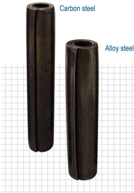
Heat treated Coiled Spring Pins

Carbon steel is less expensive than alloy steel, which is why it is the generally preferred material for Spring Pins. However, Coiled Pins with large diameters (> Ø.500" / Ø12mm) should not be produced from carbon steel because they cannot be quenched quickly enough to achieve the desired mechanical properties needed for static or dynamic applications. Hence, alloy steel is the material used for large diameter Coiled Pins because the quenching requirements are more relaxed and therefore achievable.