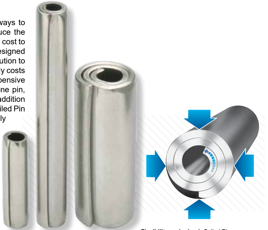
Flexibility under load: Coiled Pins continue to flex after insertion when a load is applied to the pin.

In comparison to solid pins, when Coiled Pins are used there is no permanent damage to the host part during assembly. Pins having external knurls or grooves will always, by design, cut into the mating part. Even hardened ground dowel pins, when driven into a precisely reamed hole, will damage the hole when removed. It is no accident that a standard series of oversize dowel pins is available. This method of assembly results in the inability to rework a part either in the factory or in the field. With a Coiled Pin, it is simply a matter of driving the pin out, the host part is like new.