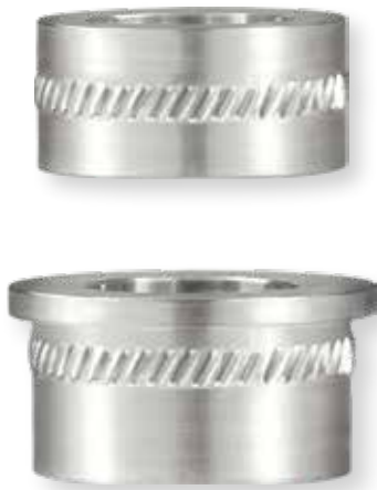
Series CL6000 Knurled