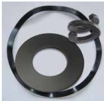
Wave Spring, Belleville Washer and Coil Spring

Drawbacks: Dissipating preload as spring fatigues, and allows yield during impact which may be detrimental to assembly (such as with a ring and pinion meshing gear set). Difficult to adjust.