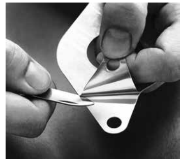
Surface Bonded Shims

Drawbacks: Sometimes it is difficult to peel layers, and discarded layers must be scrapped.