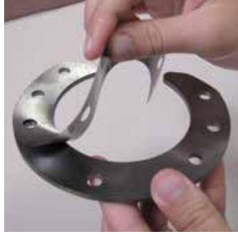
Edge Bonded Shims are easy to peel. Unused layers can be used for another application.

Benefits: Easy to peel layers. Simple and inexpensive design, maintains constant preload between service intervals, and allows for the easiest service in the field with less parts stocking. Unused layers may be used in a different assembly.