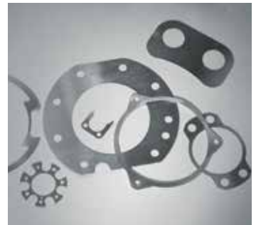
Single Thickness Shims

Drawbacks: Requires multiple stocked Shim thicknesses to achieve the proper force during assembly.