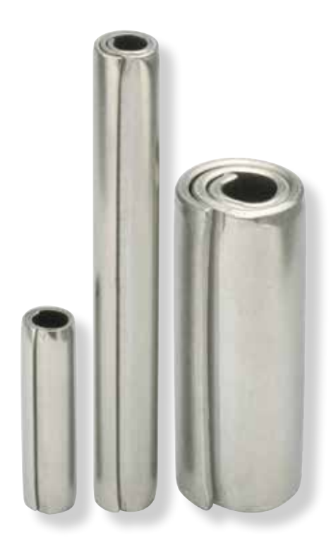
Table 1. Chemical composition (%) of austenitic stainless steel grades used for SPIROL Coiled Spring Pins

Before going into specifics on Type 316, it will help to first briefly explain how Type 302 and Type 304 are alloyed, and what allows for each one to attain its corrosion resistance.