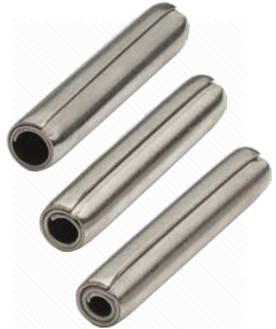
Coiled Spring Pins are offered in light, standard and heavy duty to meet application-specific requirements

While 302/304 austenitic stainless steel Coiled Pins provide excellent corrosion protection, this material is not an appropriate solution when the pin will be subject to dynamic loads, or where strength and fatigue resistance must equal or exceed that of high carbon steel. Alternatively, 420 martensitic chrome stainless steel provides an exceptional combination of strength and fatigue resistance - in addition to its inherent corrosion resistance.