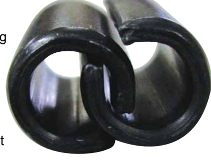
Example of interlocked Slotted Pins

Conversely, SPIROL Standard Slotted Spring Pins have a maximum slot width specification less than the material thickness and thus can not interlock. Therefore, SPIROL Standard Slotted Pins can be automatically fed and installed without risk of downtime due to interlocking, and they can be plated without risk of incomplete plating coverage.